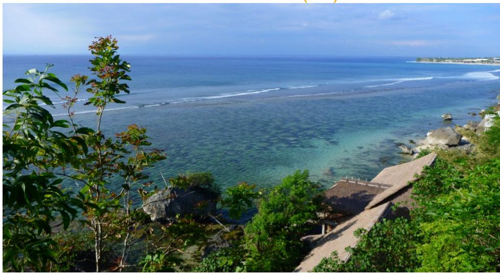
ULU WATUU- BALI