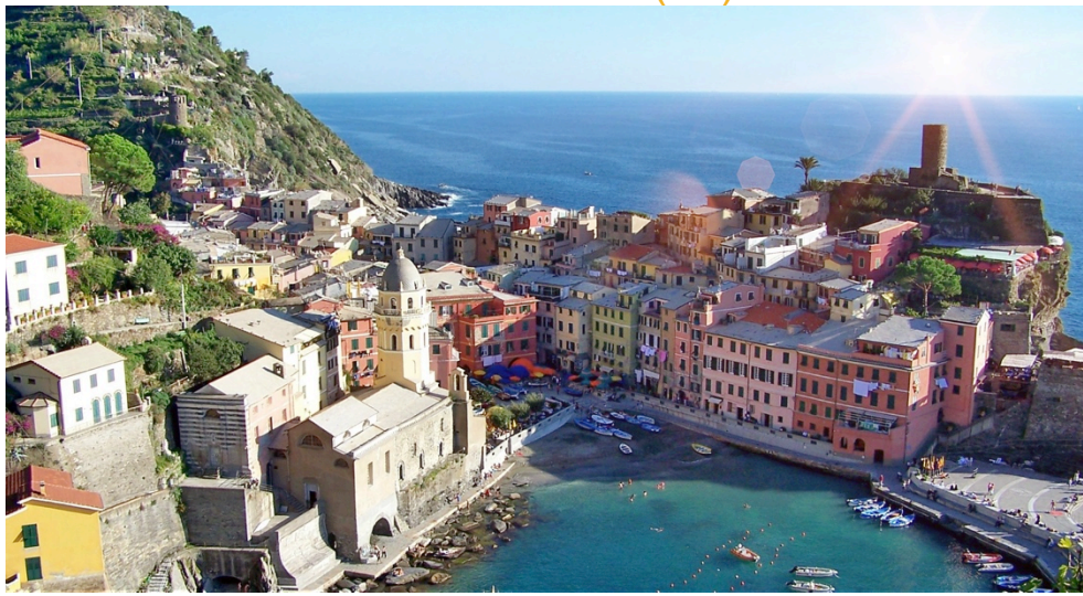
TRAVEL DESTINATION: CINQUE TERRE - ITALY